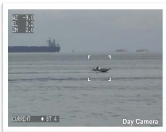
Tracking of high speed small motorboat with Day camera