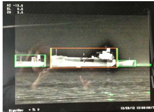
Automatic object detection mode

Video Tracking greatly adds value to both sensors, allowing the Patrol Vessel officer to track potential targets directly from the video display. This option requires the installation on the vessel of a Video Tracking Module, between the Sensor platform and the controller. The additional box does not need to be visible on the bridge but needs to be accessible for service.