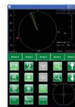
Software IP Controller