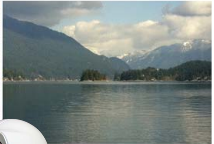
High-Definition Day Camera