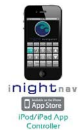
night nav Available on the App Store iPod/iPad App Controller