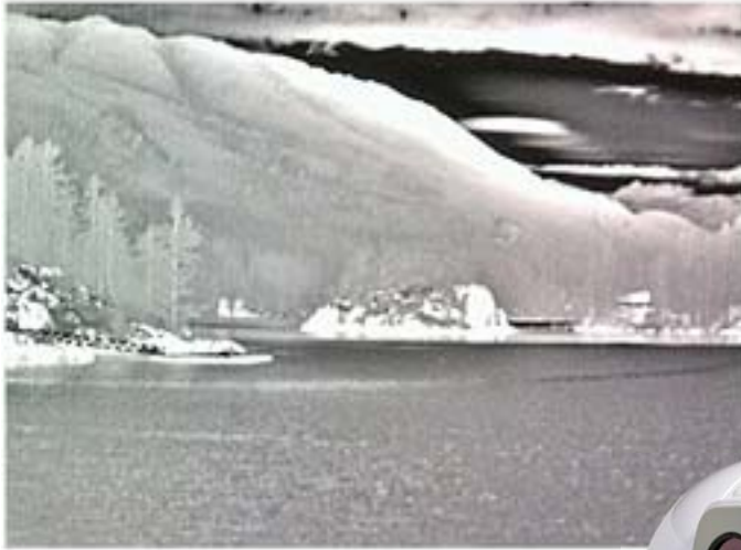
High-Resolution Thermal Imager