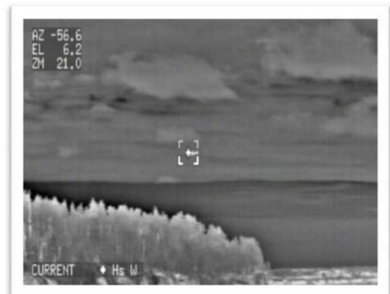
Tracking of floatplane with thermal camera