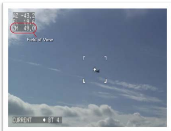
Tracking of floatplane with Day camera