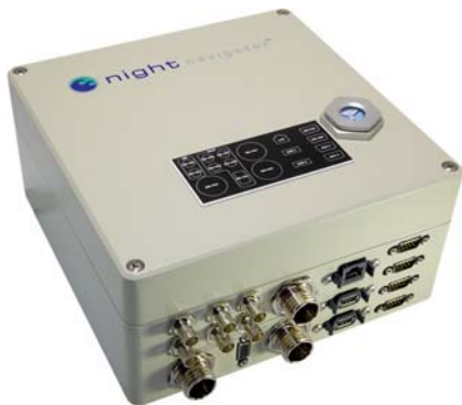
Video Tracking Module Box