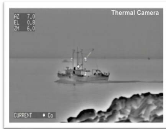
Tracking of fishing boat with thermal camera