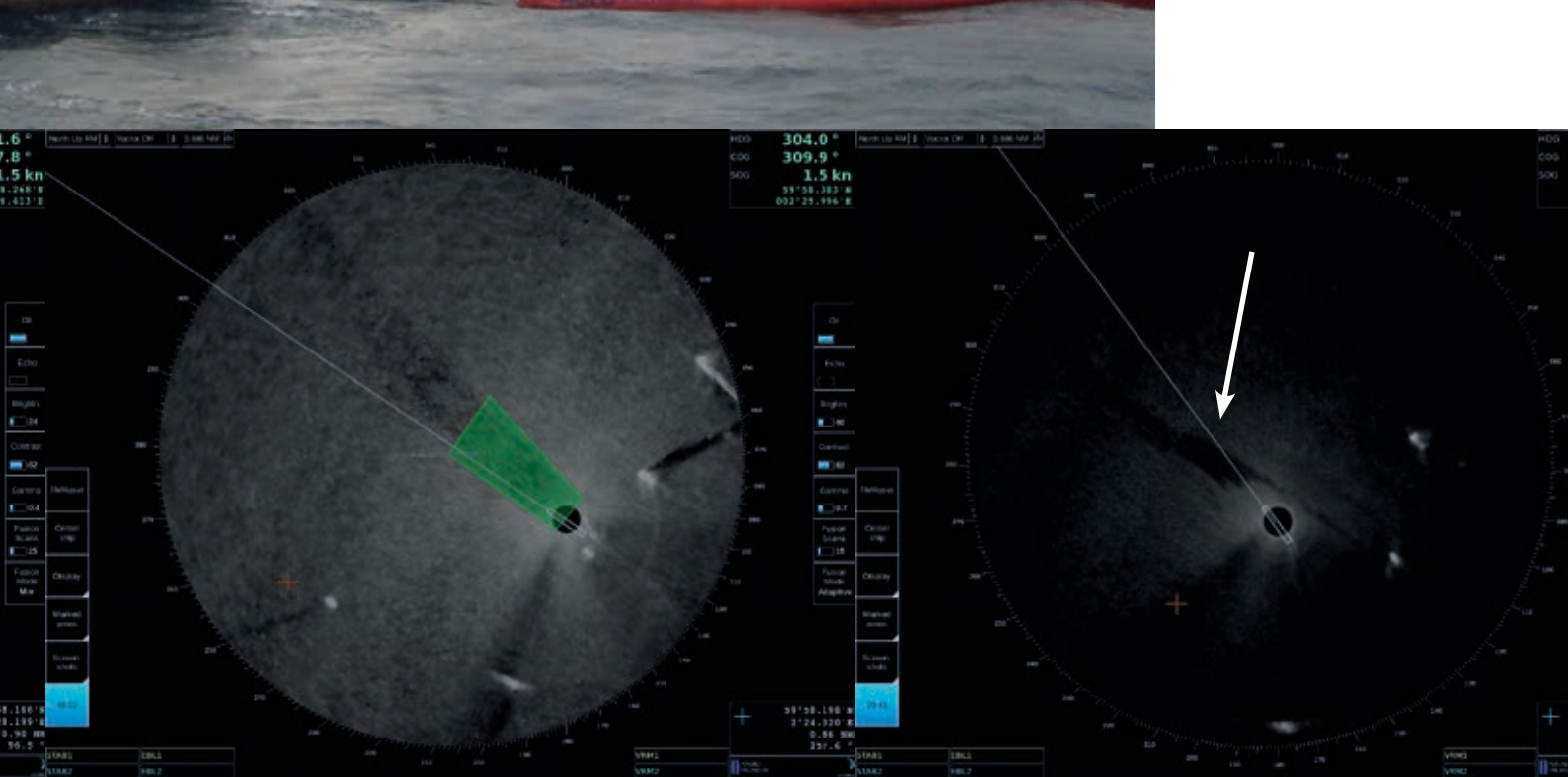
Green polygon is marked by user.

To achieve the most efficient image to detect oil, you can change between different Fusion modes and see the result in real time on the screen. Oil spill image is created with an integration of up to 100 radar antenna scans. Generated image is based on motion compensated Fusion scans. Adjust the Fusion Scan number together with Fusion Mode.