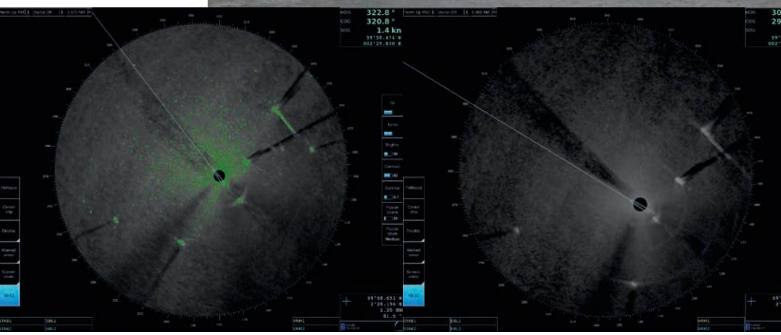
Navigation + oil radar picture. Green echoes from navigation radar, the rest is oil radar picture.

You can also take screenshots from the screen and record the raw radar video to the external hard disc or memory stick for future evaluation or training purpose.