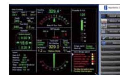
CONNING INFORMATION DISPLAY (available in 2013)

Unlike other distance learning schemes, online access to the instructors is available to ensure that any questions that the trainees may have during the training be resolved on the spot through interactive communication between the trainees and the available instructors.