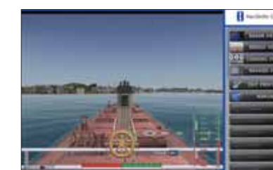
VISUAL SIMULATION DISPLAY (available in 2013)

Pay per certificate: pay-as-you-go plan depending upon the number of certificates issued, namely the number of the trainees using the service