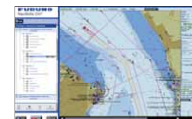
ECDIS EXERCISE DISPLAY

Training can be conducted at the offices of the ship owners, hence saving cost for transportation and accommodation for the trainees. Moreover, the contents and quality of the training programme is identical to the classroom training provided by INSTC Denmark, INSTC Singapore and FURUNO NavSkills Training Centres, which have been designed to conform to the training standards and requirements set out by flag administrations as well as vetting society. What is more, the trainees can access to the latest training programmes on the FURUNO training server at all times.