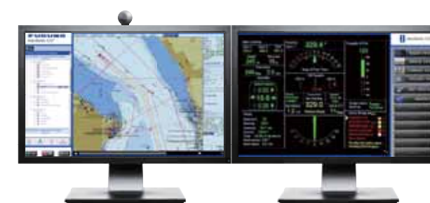
Monitors with screenshots

*Inclusive of maintenance and upgrade of the training workstation